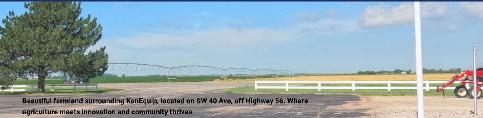
Beautiful farmland surrounding KanEquip, located on SW 40 Ave, off Highway 56. Where agriculture meets innovation and community thrives