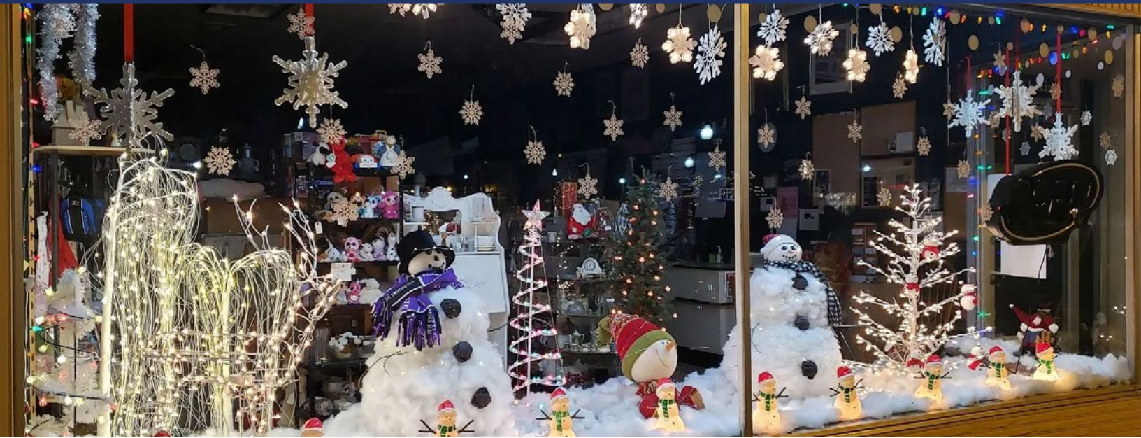
Photo from 2023